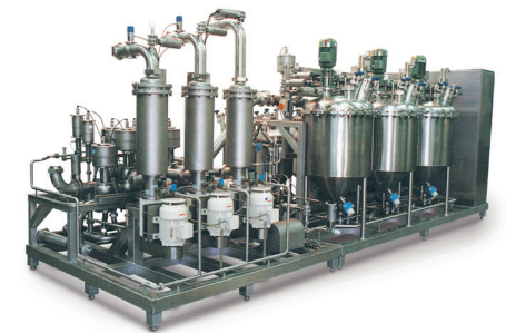
Color blending unit