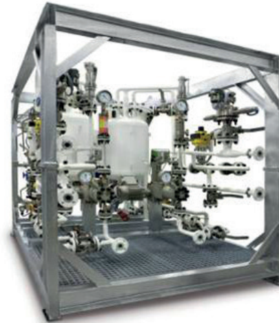
API chemical dosing unit