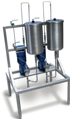
Food grade dosing system